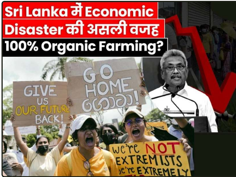
Sri Lanka economic disaster