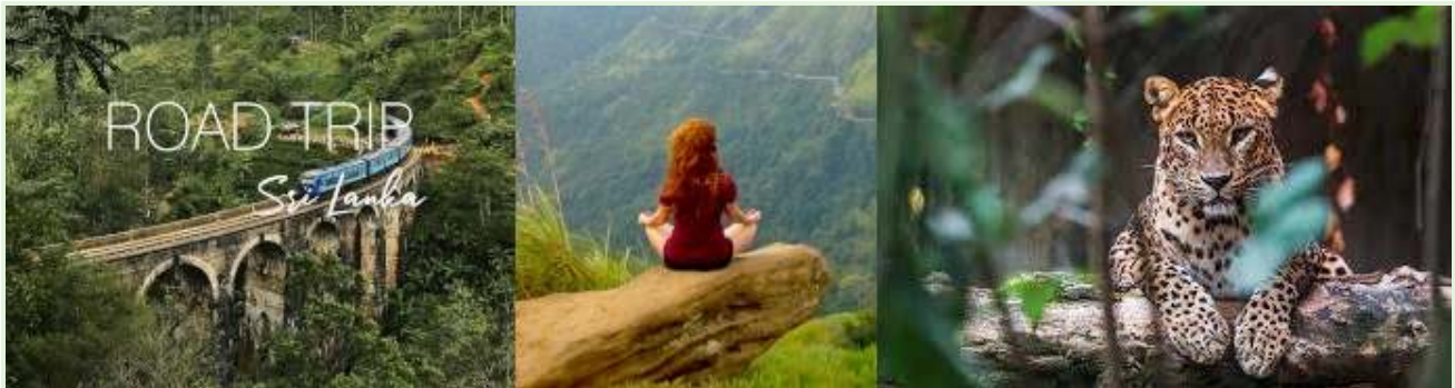
Sri Lanka vacations - Guided nature tours and expeditions

Timing: The experiment was launched during the COVID-19 pandemic, when Sri Lanka's tourism-dependent economy was already severely impacted.