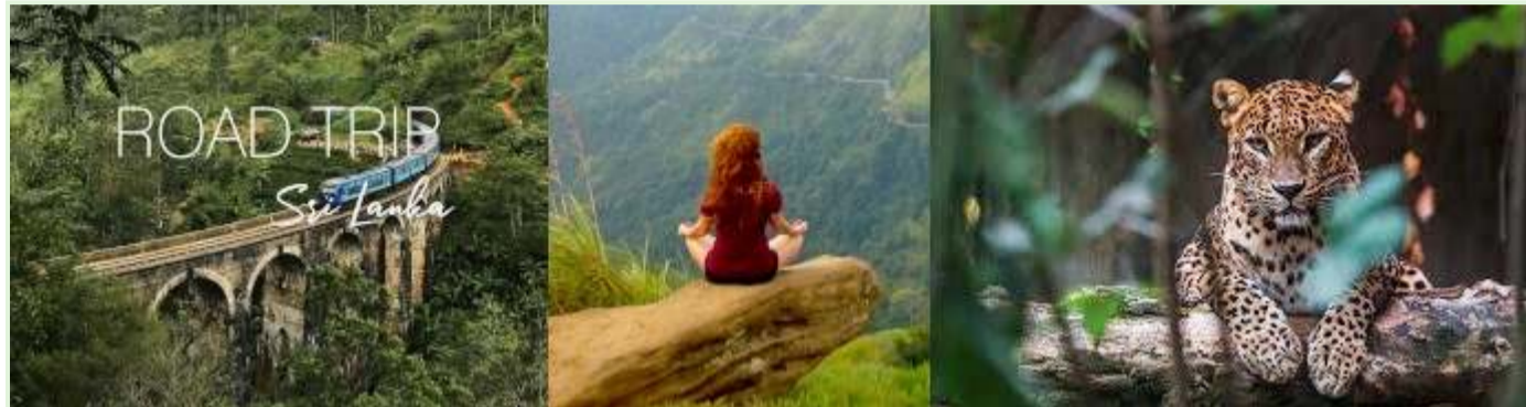
Sri Lanka vacations - Guided nature tours and expeditions

Timing: The experiment was launched during the COVID-19 pandemic, when Sri Lanka's tourism-dependent economy was already severely impacted.